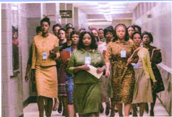
Image from Hidden Figures Movie: Depicts the women of NASA in the 1960's