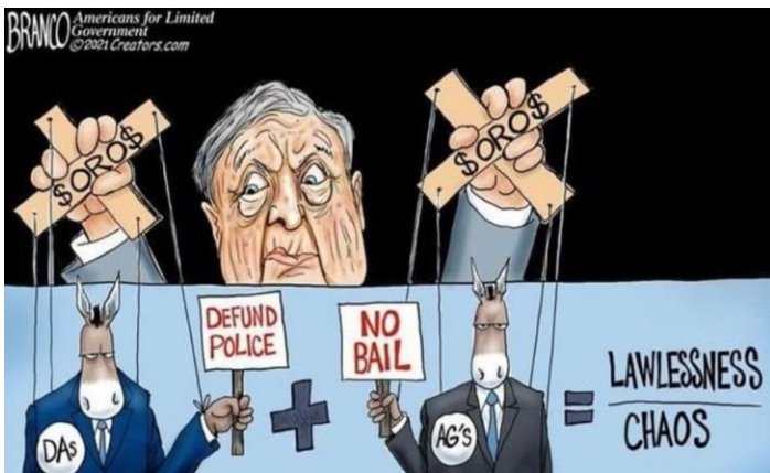
text adapted from Facing History and Ourselves, 2022

In this comic from 2021, George Soros is depicted as a puppeteer advancing progressive causes that in reality often were championed by black activist movements and civic leaders.