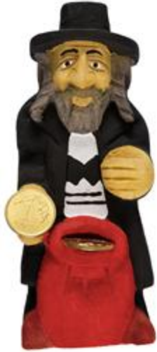
text adapted from Facing History and Ourselves, 2022

A figurine from Poland, made in 2018, of a Jewish man with a sack of money.