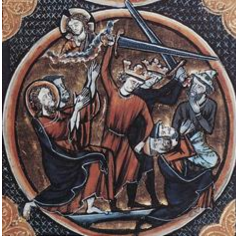
An illustration from a 13th century manuscript of the bible showing two Jews about to be killed in revenge for the death of Jesus, who looks on (top left).