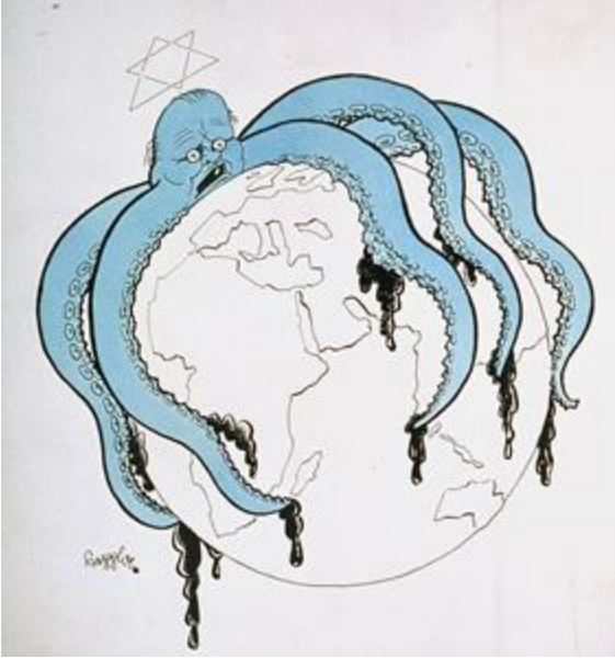
A Nazi propaganda cartoon warning of a worldwide Jewish conspiracy.

text adapted from Facing History and Ourselves, 2022